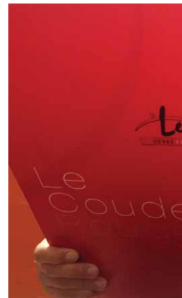
Authentic French cuisine with a fine wine selection in a cozy bistrot.