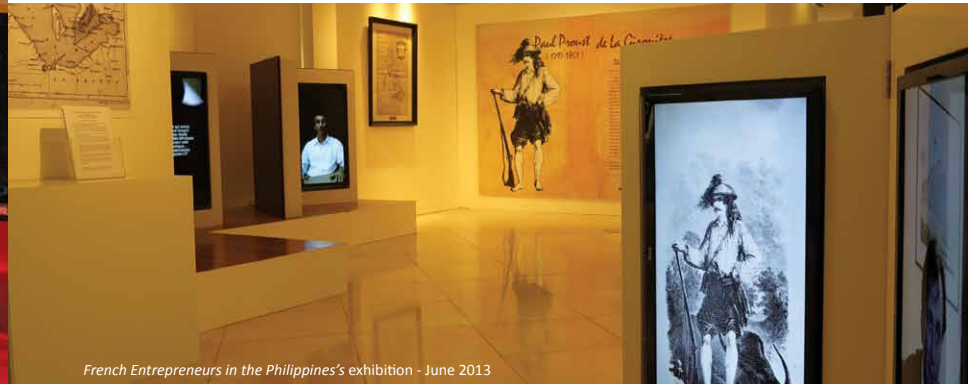
French Entrepreneurs in the Philippines's exhibition - June 2013