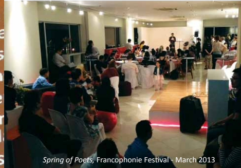
Spring of Poets, Francophonie Festival - March 2013