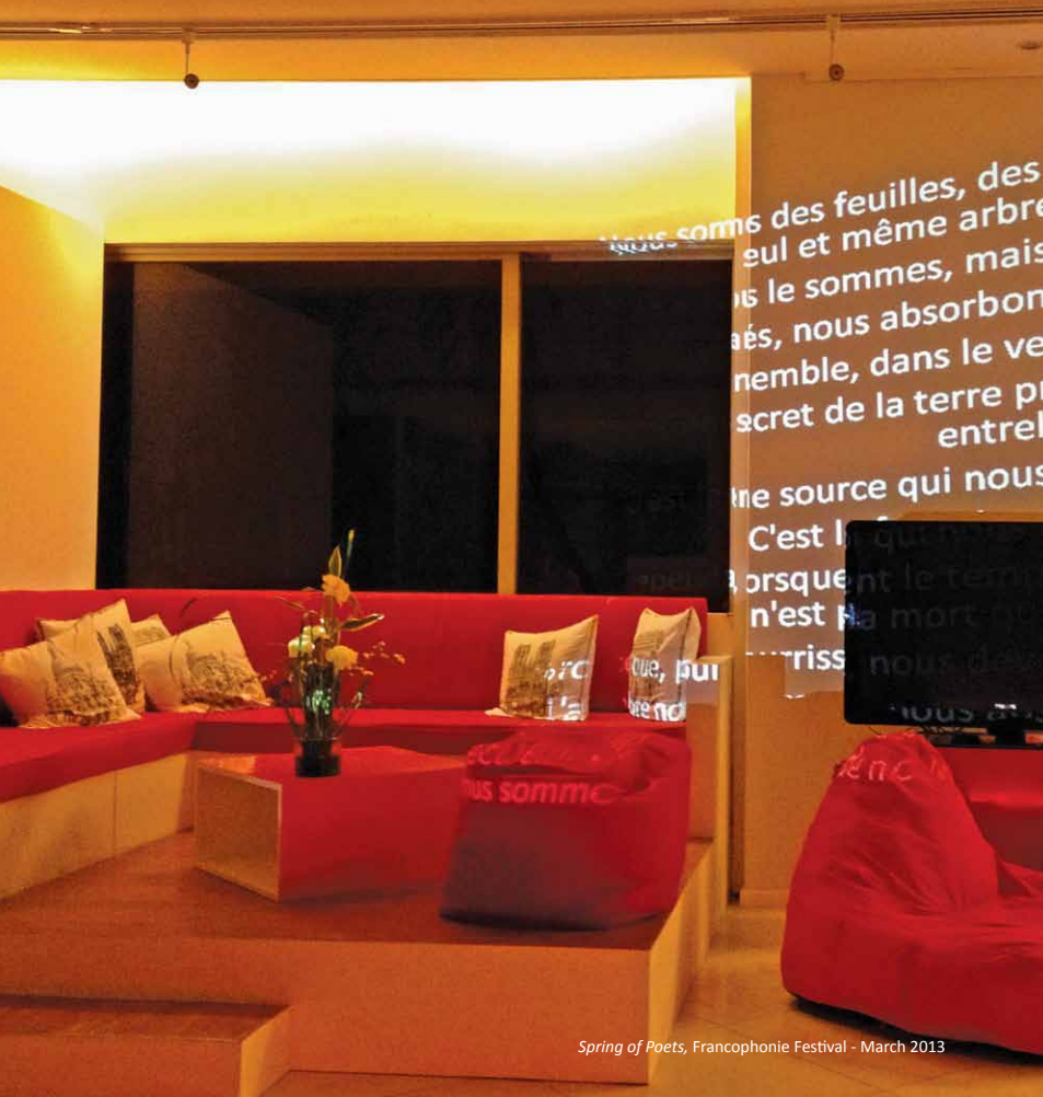
Spring of Poets, Francophonie Festival - March 2013

A modular space. An adaptable lounge cafe area for events and exhibits.