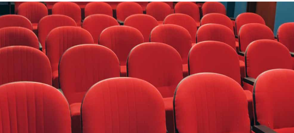
A comfortable auditorium with a giant 3D screen. A regularly updated selection of french books and magazines available in a functional and multimedia library.